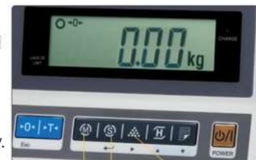
Function Accumulation Count